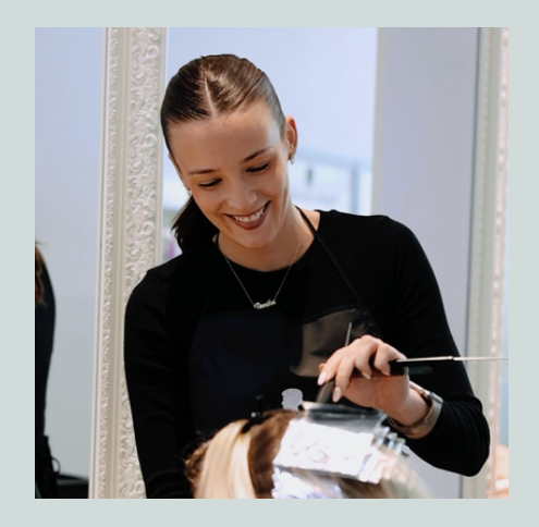
30% off hair services*

Your personalised journey starts here! Whether you're ready for a big change or just a refresh, we're here to guide you every step of the way.